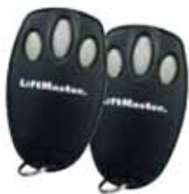
3-channel mini remote control (5580-2) (5580K)