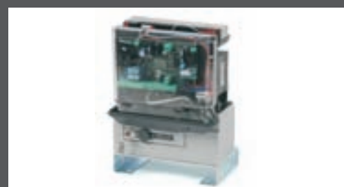
BRAIN24 control unit built-in