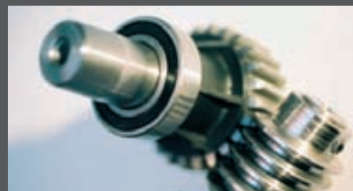
The high quality of the raw materials assures a long life of the product and a silent movement.