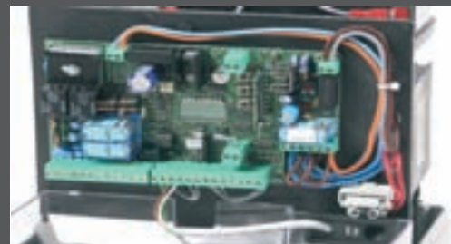
The 24Vdc version includes the battery charger for the automatic use of the automation in case of power failure.