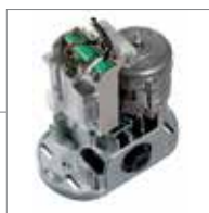
Motor ground fixation